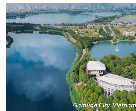
Gamuda City, Vietnam