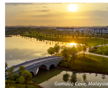
Gamuda Cove, Malaysia