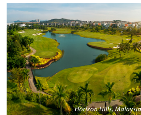
Horizon Hills, Malaysia