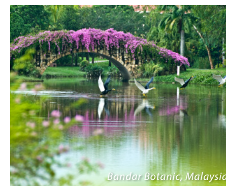
Bandar Botanic, Malaysia