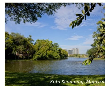
Kota Kemuning, Malaysia