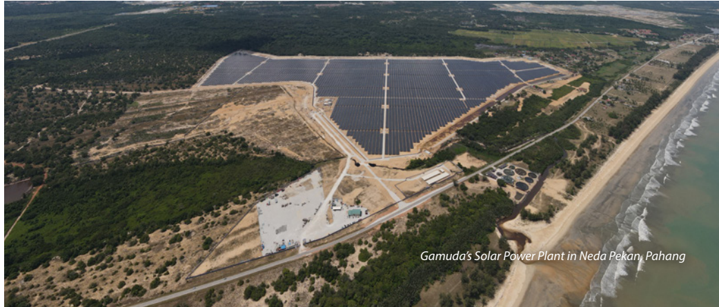
Gamuda’s Solar Power Plant in Neda Pekan, Pahang